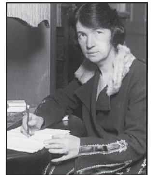
Margaret Sanger, eugenicist

Margaret Sanger (1879-1966) was born into a poverty-stricken family of eleven children. Her second husband was a millionaire who enabled her rise to affluence. After establishing her first birth control clinic as a result of her obsession with total sexual “freedom,” she became active in the eugenics movement. Eugenics is a phony science that advocates compulsory “breeding” of the select, contraception among the poor, and sterilization and euthanasia for the “unfit.” This became the foundation for the practice of contraception, sterilization, abortion, and euthanasia. 1